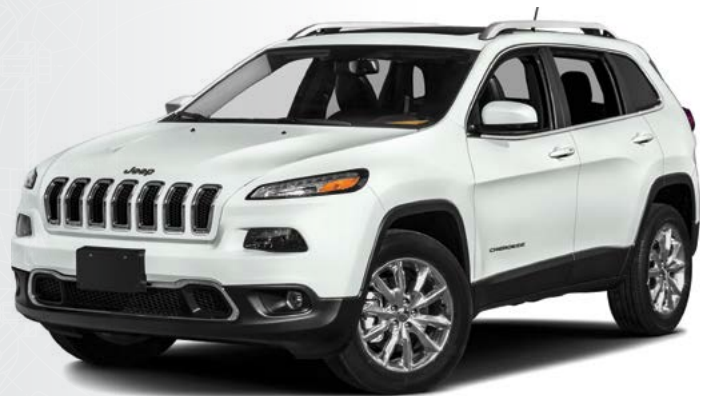
2022-2014 Jeep Cherokee (KL)